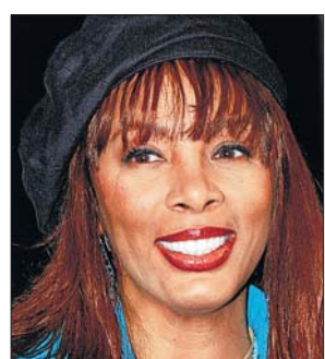
Donna Summer

LOS ANGELES, PTI: "Queen of Disco" Donna Summer, who shot to fame with iconic hits like "Last Dance", "Bad Girls" and "Love to Love You Baby" in the 70s, died after losing her battle to lung cancer.